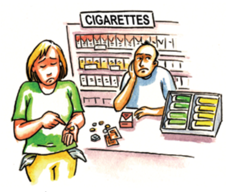
It costs lots of money.