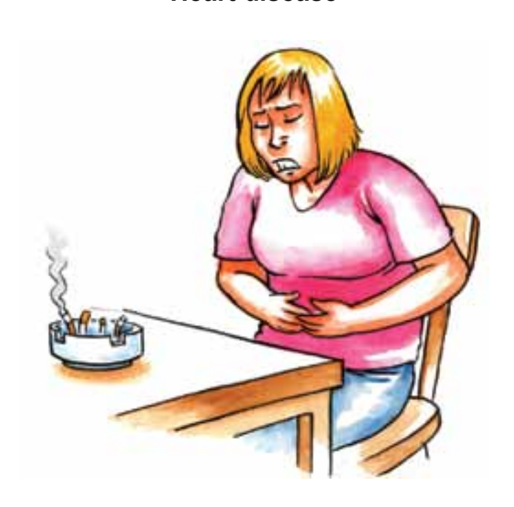
Mouth, throat, stomach and bowel problems