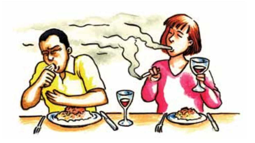
Smoking near other people can make THEM ill.

Smoking when you are pregnant can harm your baby. Being in a smoky place might harm your baby.