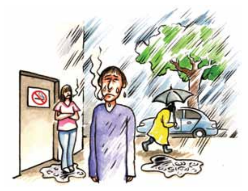
There are lots of places where smoking is not allowed.