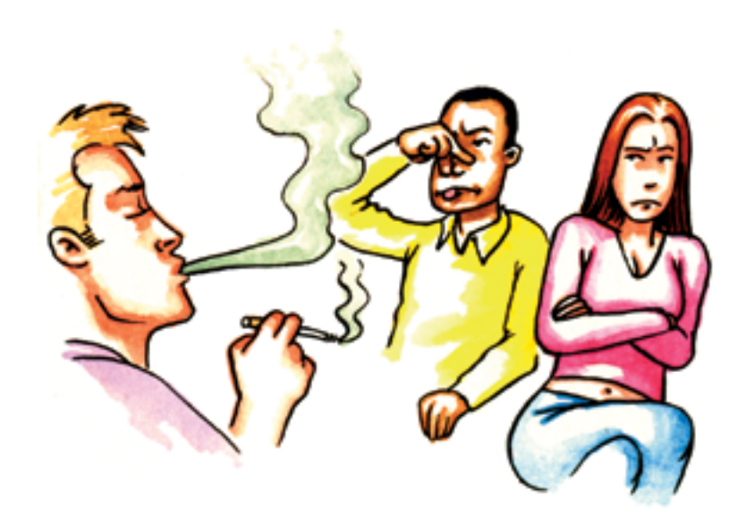
People who don't smoke don't want you smoking near them.