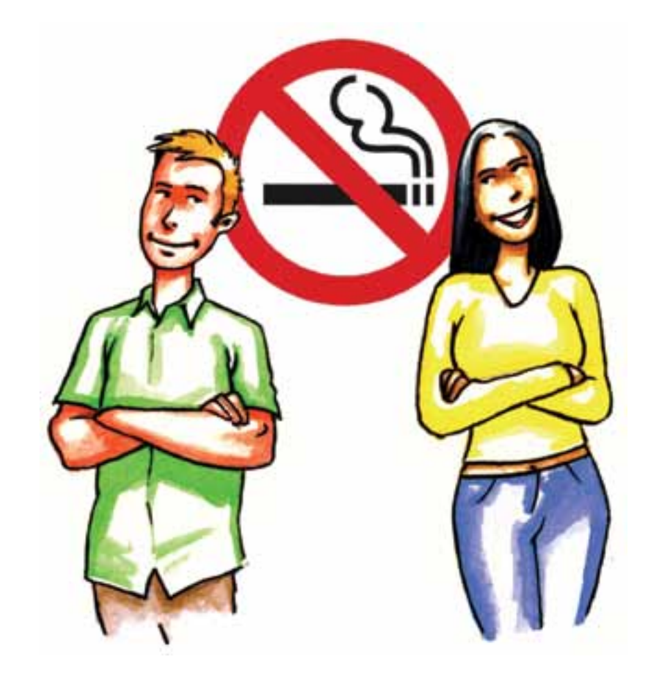
a guide to giving up smoking