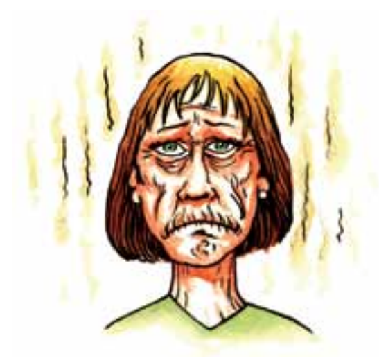
It makes you smell and your skin wrinkly.