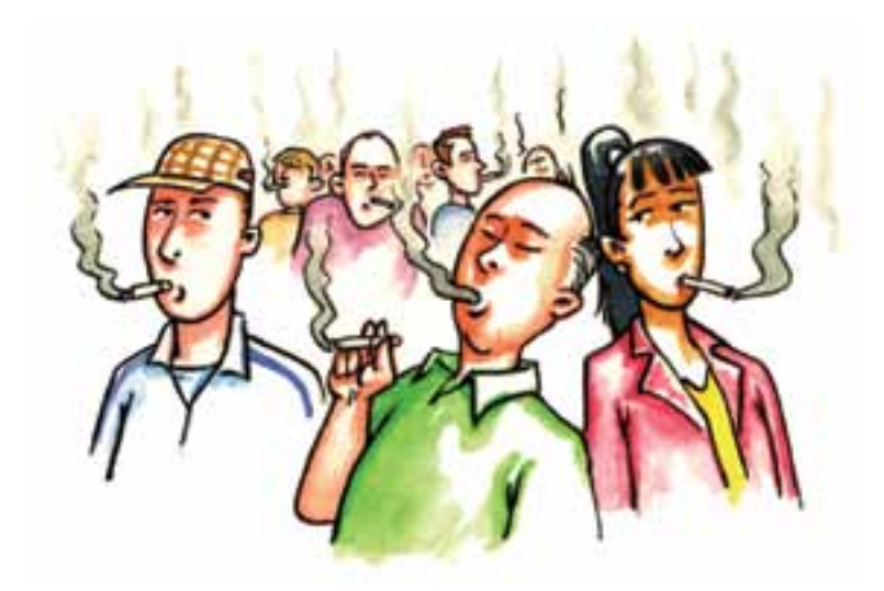
Many people still smoke cigarettes and use tobacco.